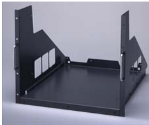
RK-C1900E ■ EIA Rack Mount Adapter

Design and specifications subject to change without notice.